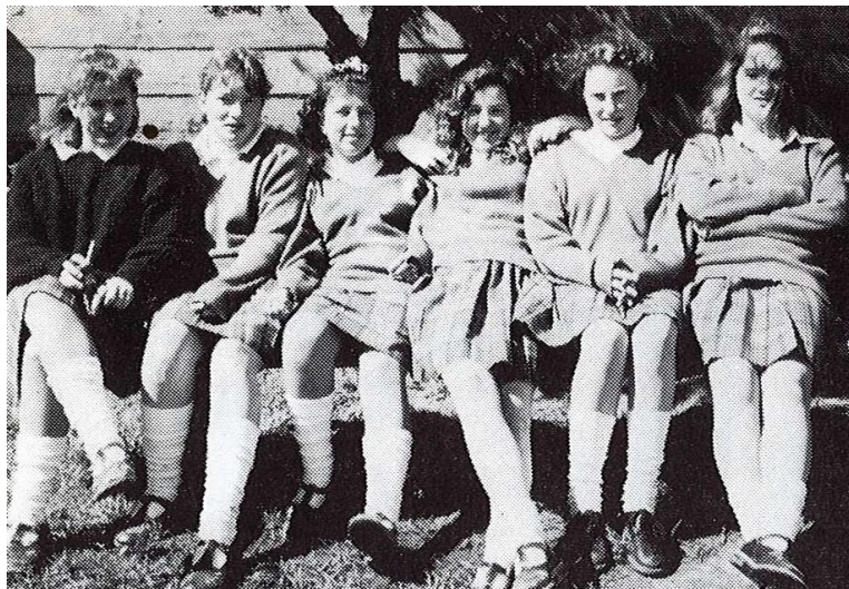
Year 7 1990