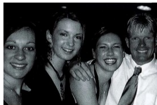
Year 12 2003