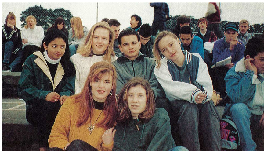
School Life 1993