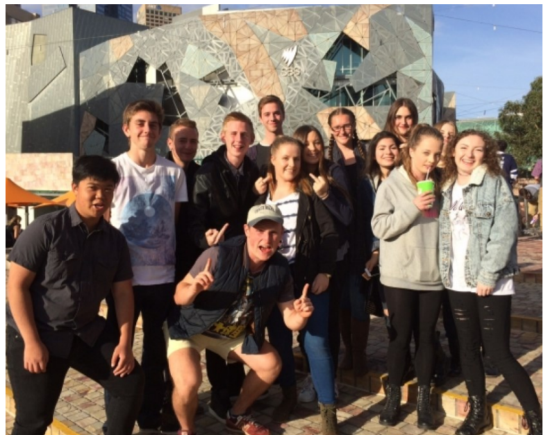
Art Excursion 2015