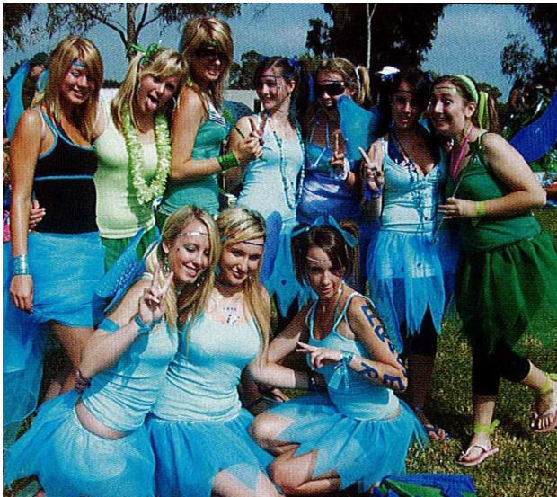
Seniors poolside 2006