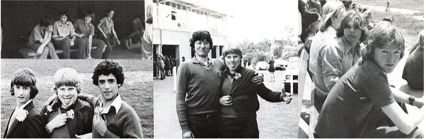
Unicorn Yearbook Pages 1978