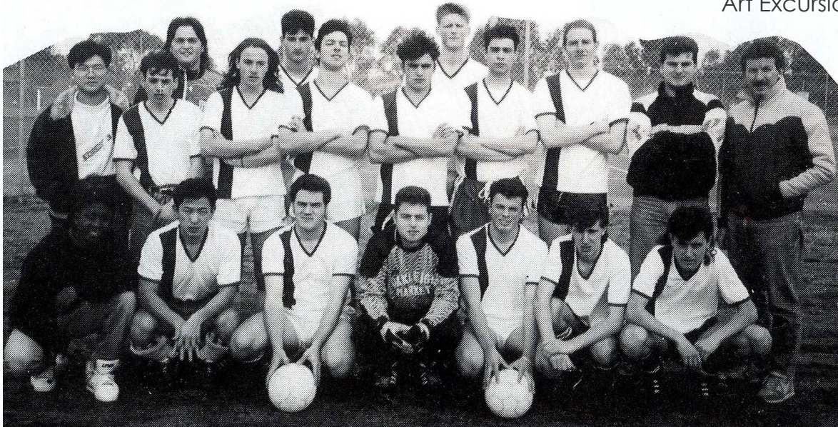
Senior Boys Soccer 1991