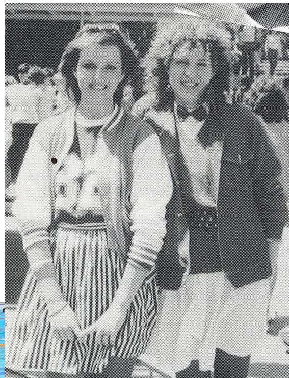
School Life 1983