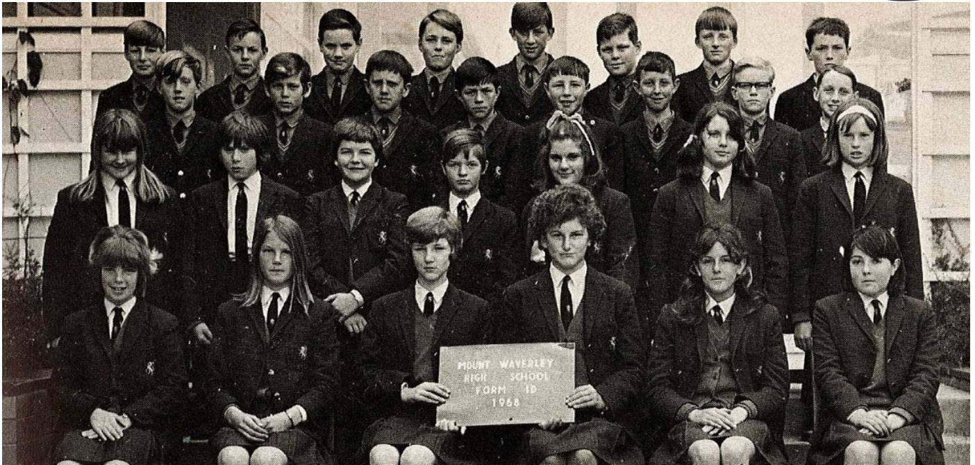
Form ID 1968