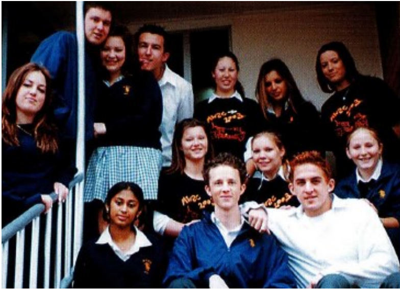
↕ Year 12 2003