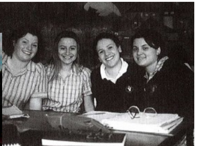
Study Group 1994