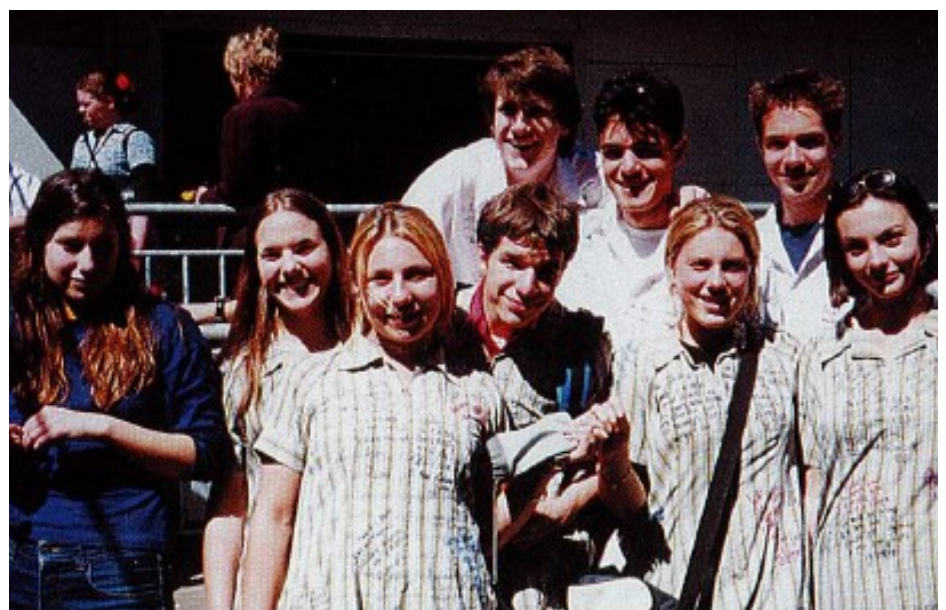
Year 12 2000