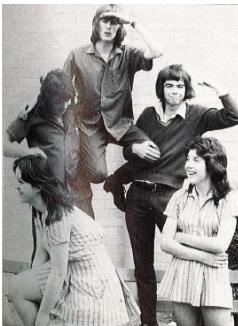
School Life 1973