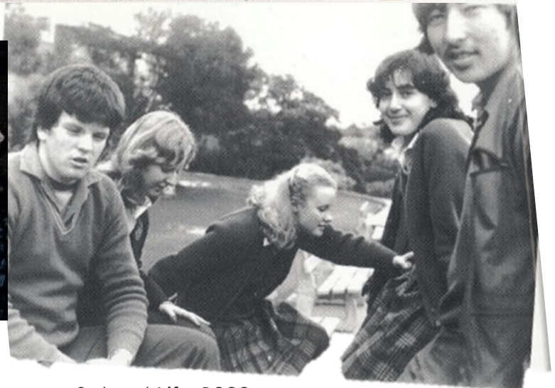
School Life 1983