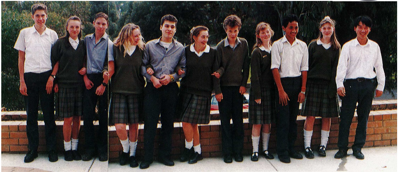
School Life 1992