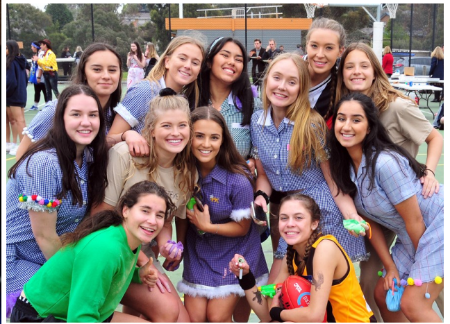
Year 12 2019