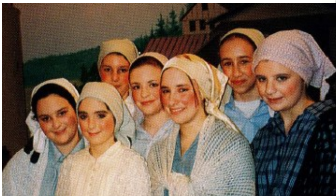
School Production - Fiddler on the Roof Choir 2001