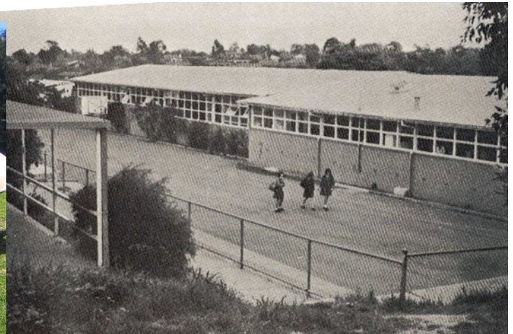
School Grounds 1977