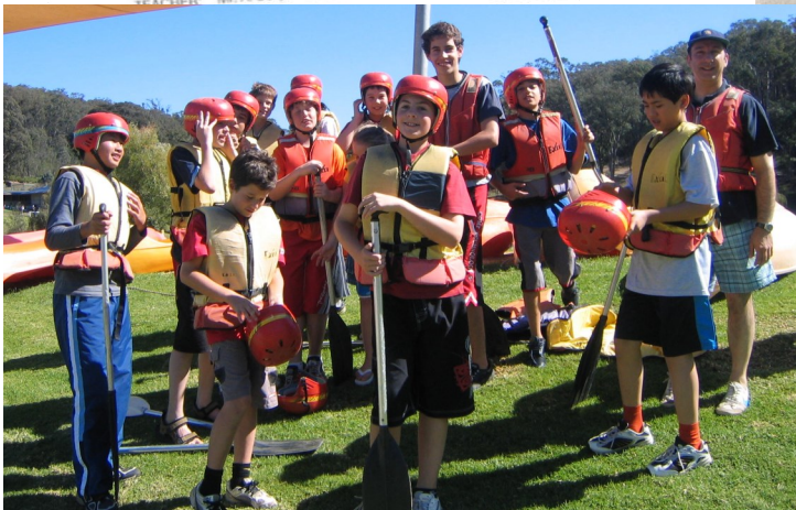
Year 7 Camp 2005