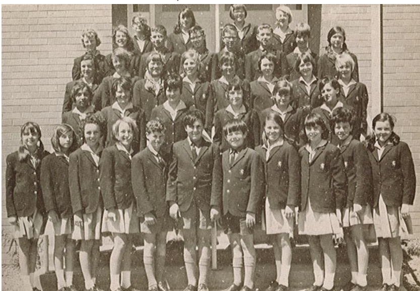
School Choir 1967