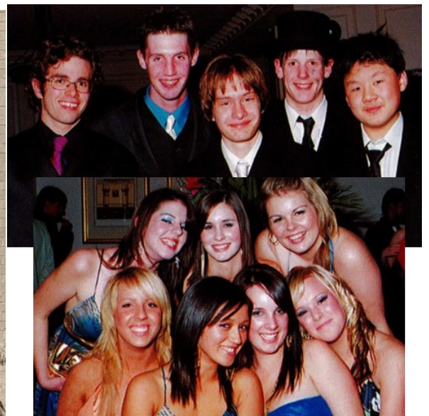
Year 12 Formal 2006