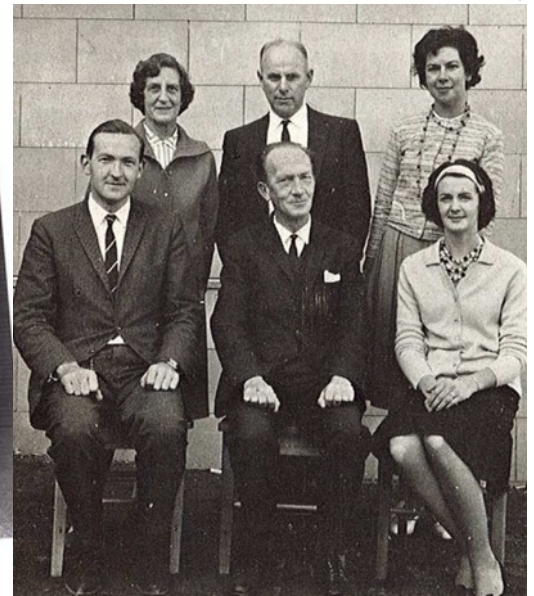
Original Staff 1964